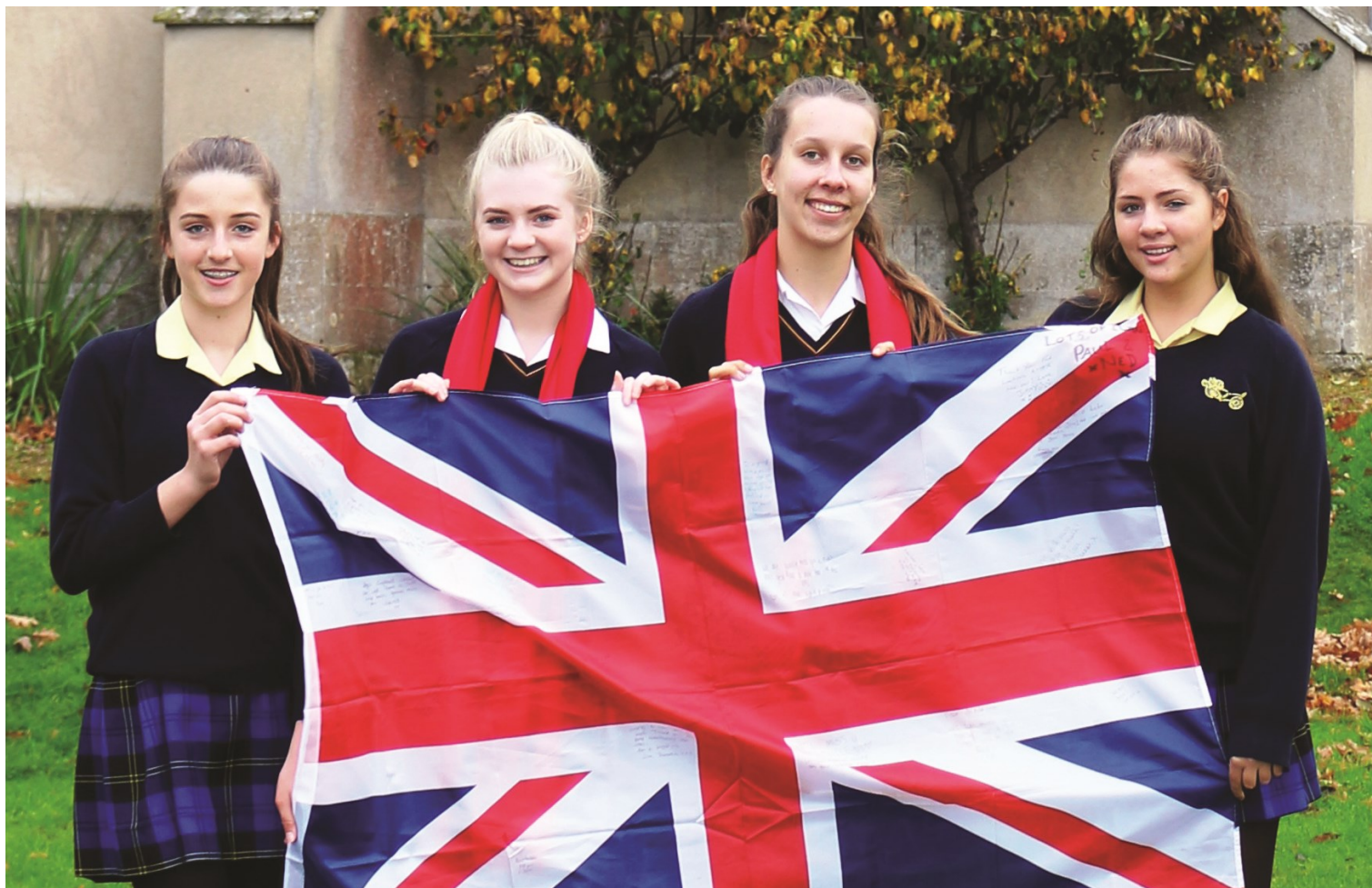
Year 10 Australia Exchange with Pupils from St Hilda's School, Gold Coast

Last term, I attended a meeting in London that took me out of school for a day. To get there I did what I am sure many of our parents do on a daily basis, I went on a train journey - a nostalgic experience for me. As I sat in the carriage - far emptier than many of the carriages that I imagine commuters battle with each morning - I settled down to do some work. Before long I was distracted and found myself looking out of the window at the countryside rushing by. It made me think a little of how life is full of journeys that we make to get from A to B, and the various devices, search engines, sat navs that we use to tell us how quickly and efficiently we can get there. In a modern world, where everyone is busy, there is clearly an attraction to getting through things as quickly as one can; getting things done, but paying scant attention to the process and the experience, in order to get on to the next thing. To me education can be a little like this. I remember when I was at school always wishing to be at the next stage: junior to senior school, to sixth form, to university...and while I thoroughly enjoyed my education, it might have been better to have participated in the experience a little more, rather than seeing each stage as a level we have to mine for badges and awards in order to move on to the next.