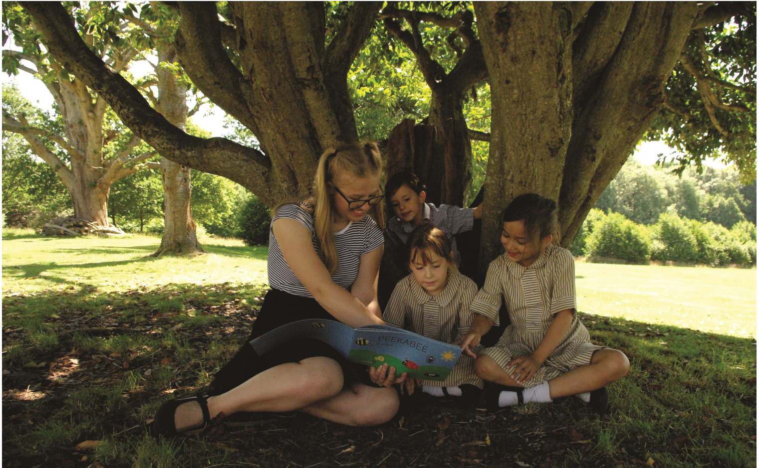
Year 1 enjoying Peakabee, the Year 12 Young Enterprise business venture

We have heard a great deal of the words strong and stable over recent months and if hearing them has done anything to our world view, it is to confirm that what we thought we knew and expected, is not what we thought we knew or expected. This, of course, can be applied both politically and in a broader sense. It is at times of uncertainty that we turn to things that are reliable and dependable; things that have a constancy about them. However, there needs to be a balance between reliability and evolution.