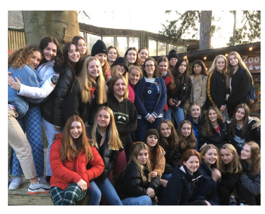
Year 11 Geography pupils enjoyed a day out in Bristol on 6 February looking at urban regeneration in the morning and took part in a rainforest session at Bristol Zoo in the afternoon. View Tweet