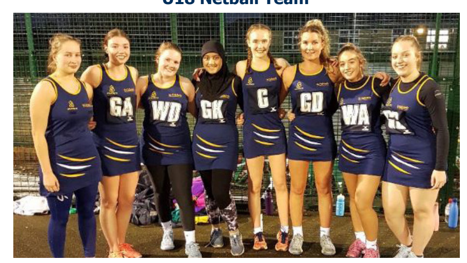
Another amazing win for our Sixth Form super squad on Wednesday 22 January against Willink School.