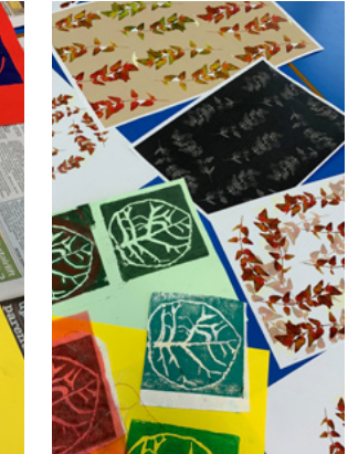
Year 10 Pattern Work