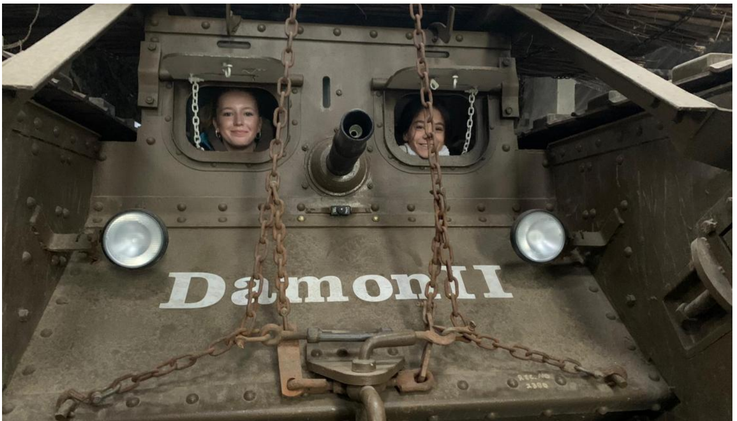
Belgium Trip 2023