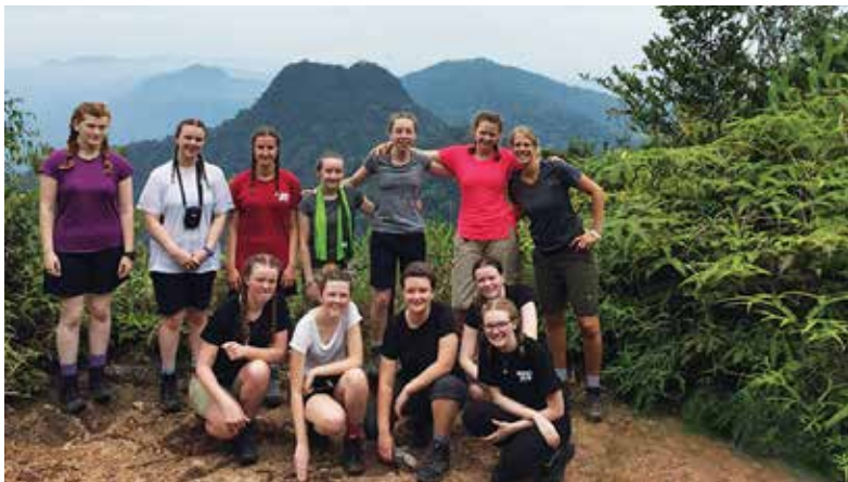
Page 26 - Sixth form students trekking in Borneo