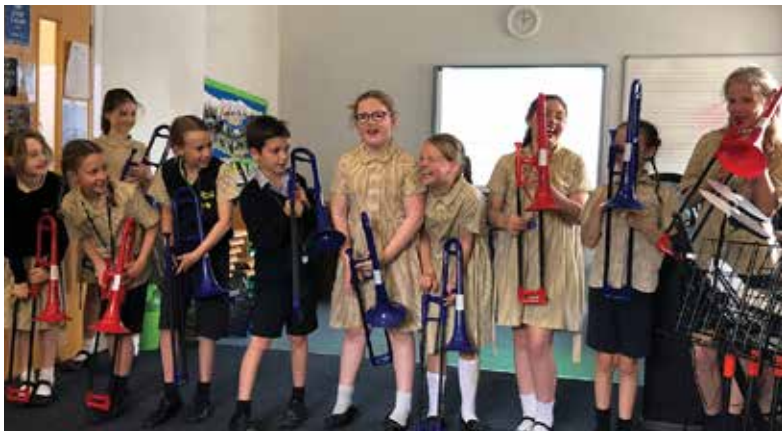
Page 12 - Year 4 host a PBone concert