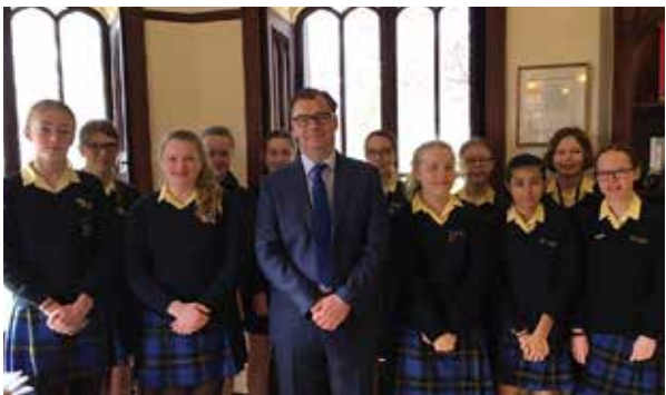
Page 27 - Year 9 Higher Project Qualification