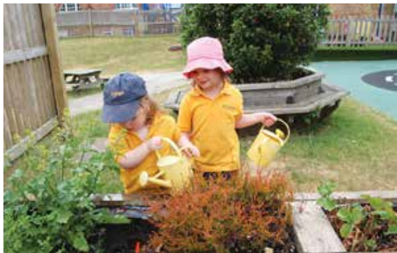
Page 4 - Children water thirsty plants