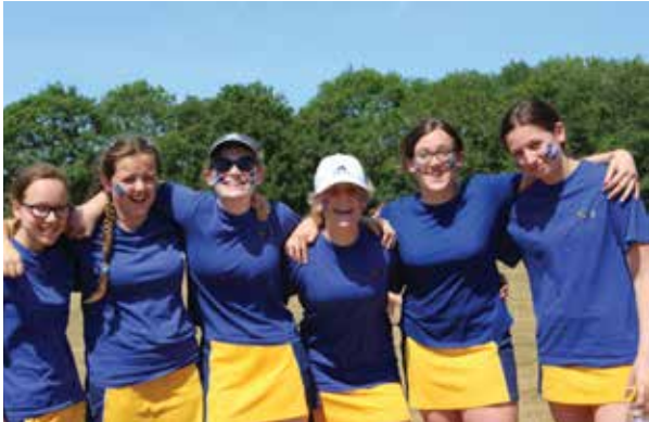
Page 21 - Senior school girls shine on Sports Day