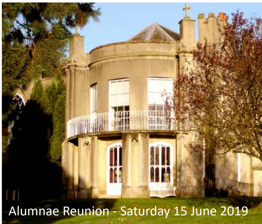
Alumnae Reunion - Saturday 15 June 2019