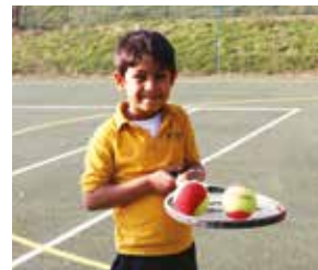
Anyone for Tennis?