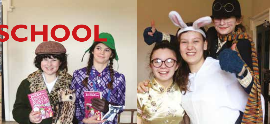
World Book Day